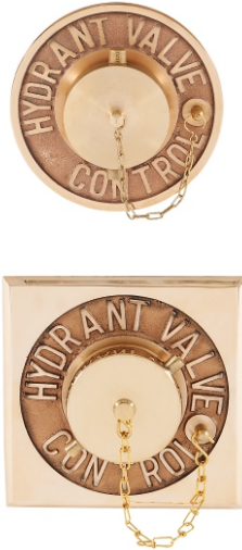
MODELS 5850 & 5852