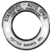
ROUND IDENTIFICATION PLATES